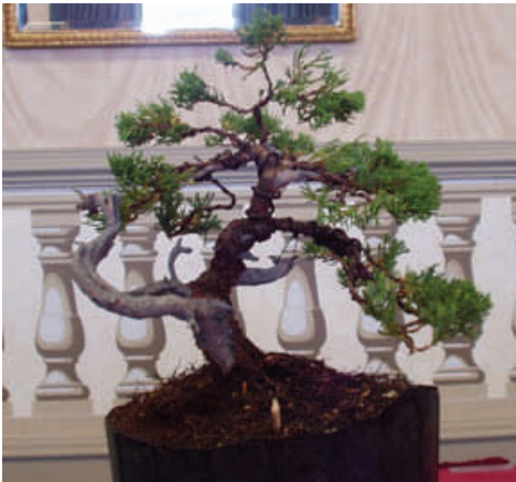
Here is the tree that I styled.

1st place prize was a trip to Japan which perhaps I will win this next year. For 2nd place I won $100 in free tools and 25% off my next order of tools. My name, face, and tree will be featured in the national magazine of the American Bonsai Society. This competition has helped to launch others professional bonsai careers.