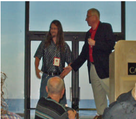
Me accepting my certificate.